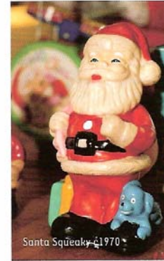
Santa Squeaky c.1970