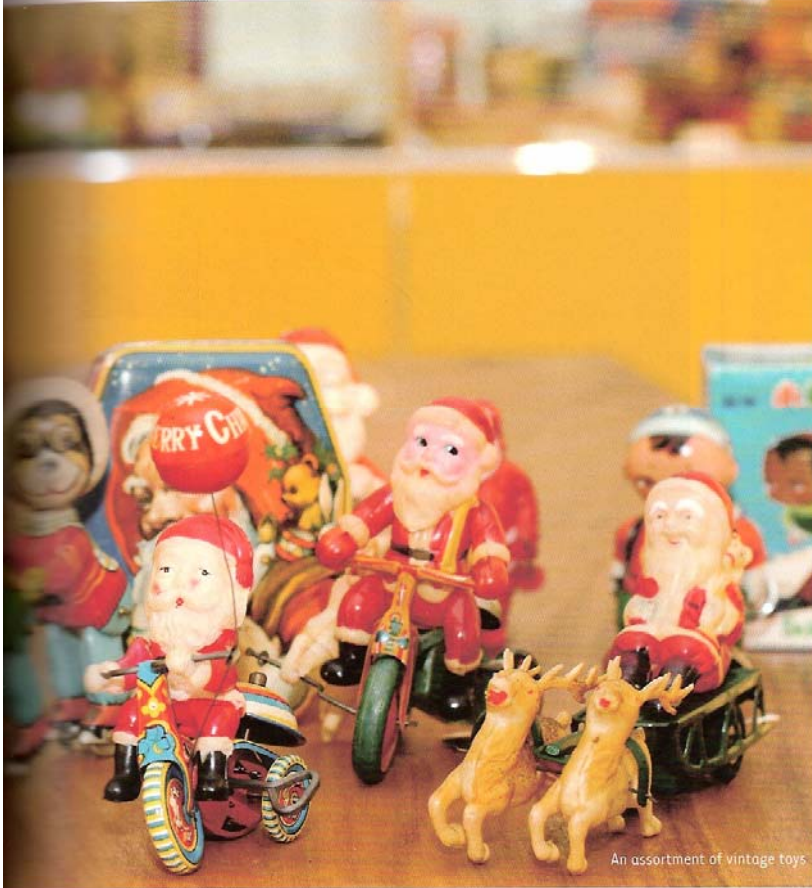
An assortment of vintage toys