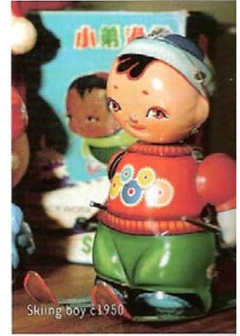
Sking boy c.1960