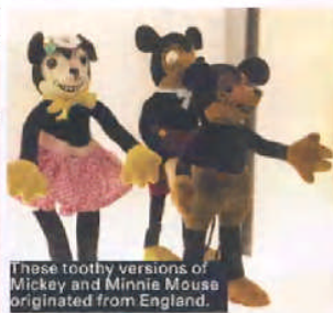
These toothy versions of Mickey and Minnie Mouse originated from England.