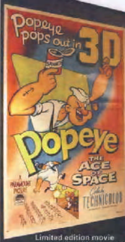
Limited edition movie posters like this are worth a whopping amount!