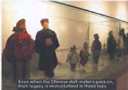
Even when the Chinese doll-makers pass on, their legacy is immortalised in these toys.