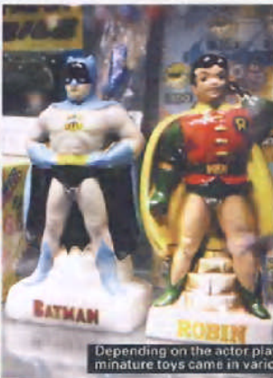
Depending on the actor playing Batman in that era, the miniature toys came in various sizes – lean, stout or fat!