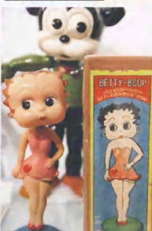
Japanese assumed all Caucasians were blonde so they gave Betty Boop a bleached 'do!

Who should come: Anyone with an inner child in them. Me, me!